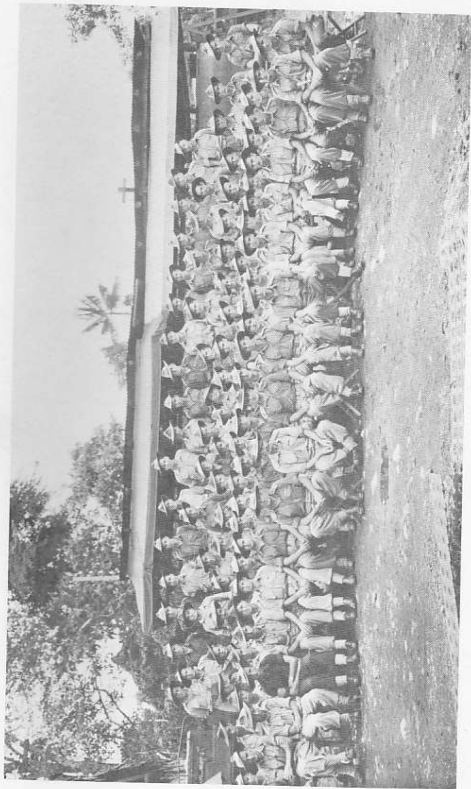
6 Aust Army Topo Survey Coy.