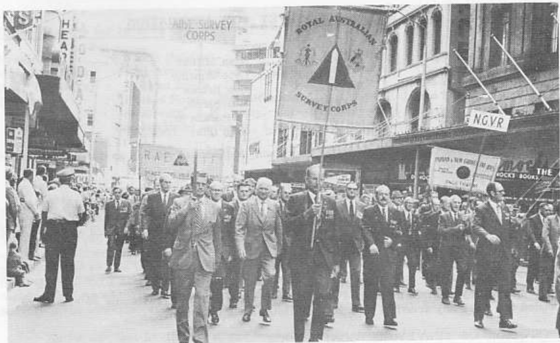
Anzac Day, Sydney, 1974, proceeding up George Street under the new banner.